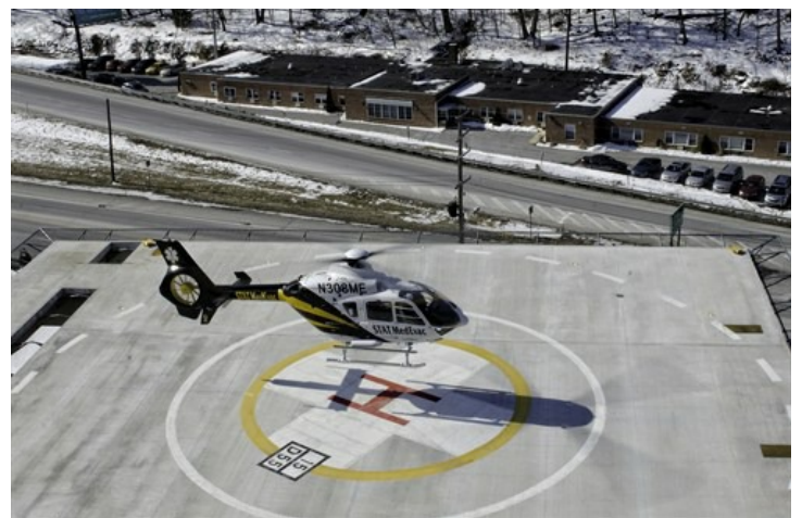
Information provided by WellSpan York Hospital and Fox43 Media.