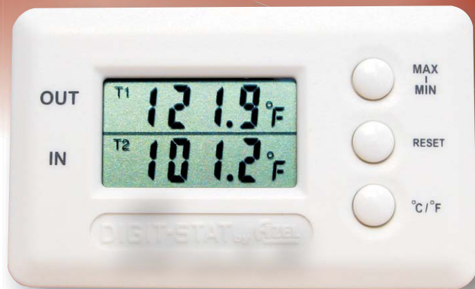
30120 Actual size

The microprocessor-based, Infloor Sales & Service Digital Temperature gauge 30120 represents the "next generation" in temperature gauge industries. The bold, hi-contrast LCD display ensures accurate temperature reading to the tenth degree and can be easily read from greater distances than the conventional mechanical temperature gauge.